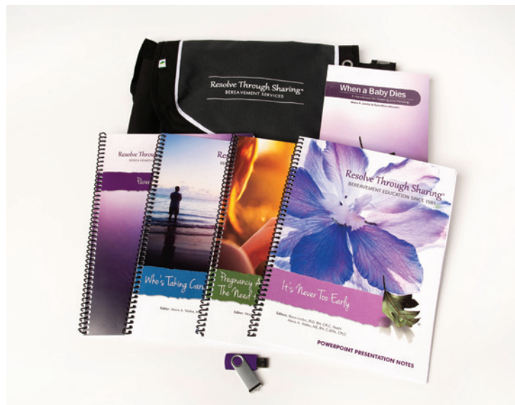
The RTS program offers a variety of training and support materials.