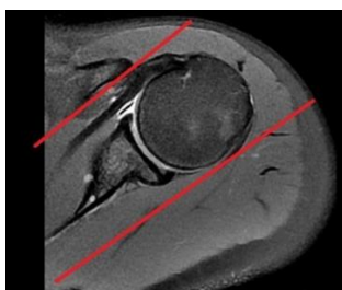
Coronal Obl Coverage