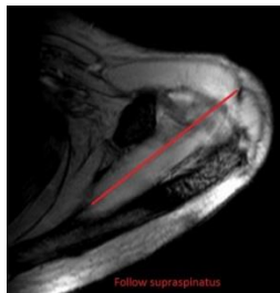
Coronal Obl Angle