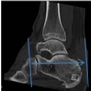
Coronal MPR 2x2mm