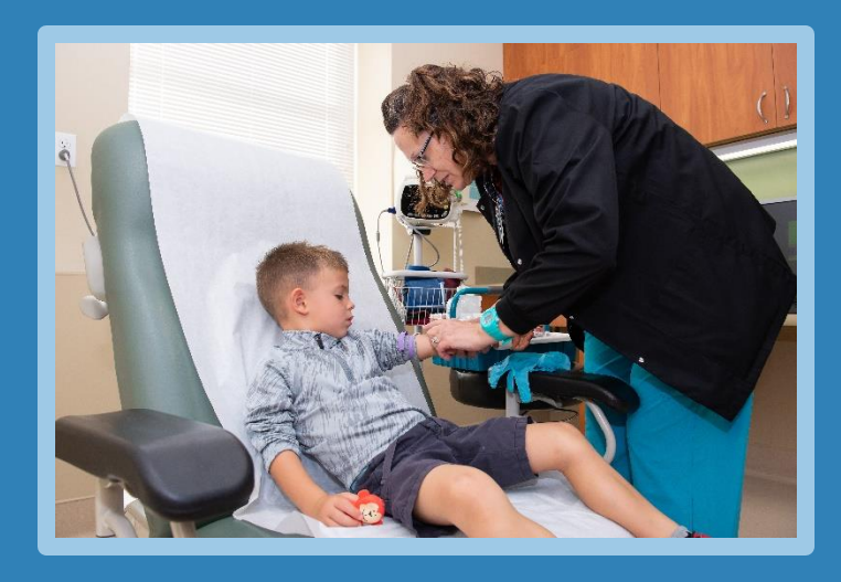
I may need to have lab work done.