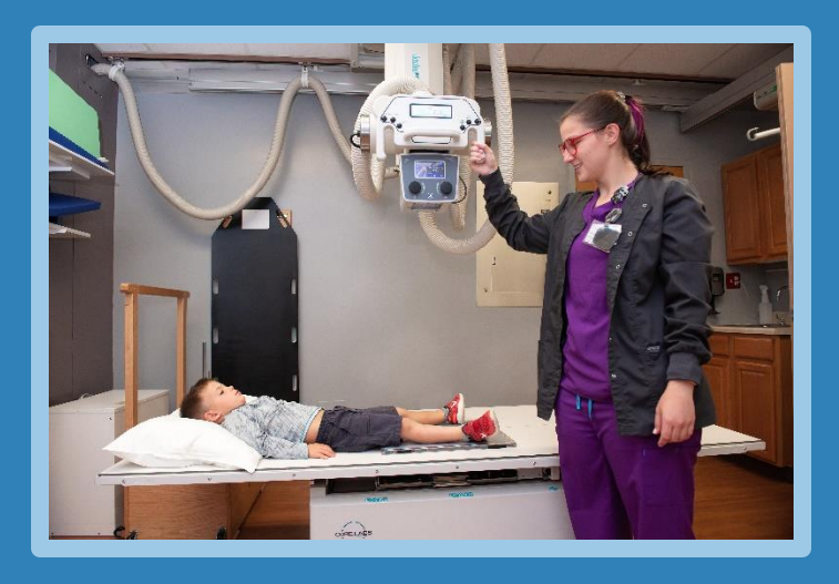
I may also need to have X-rays.