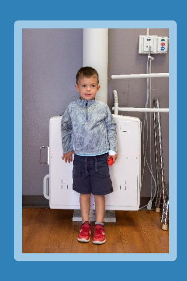
There are lots of special machines.