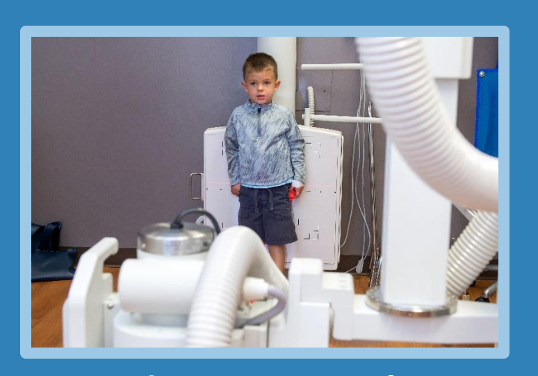
They are cool.