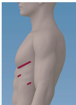
Minimally invasive heart surgery scar