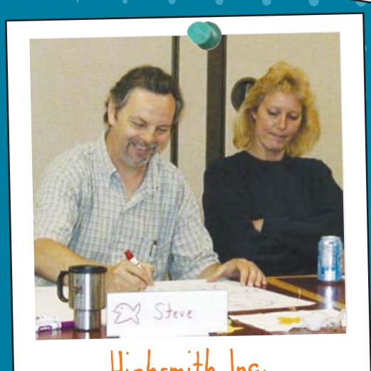
A MID-SIZED COMPANY WITH MENTAL HEALTH-FRIENDLY POLICIES THAT HAVE PAID OFF.