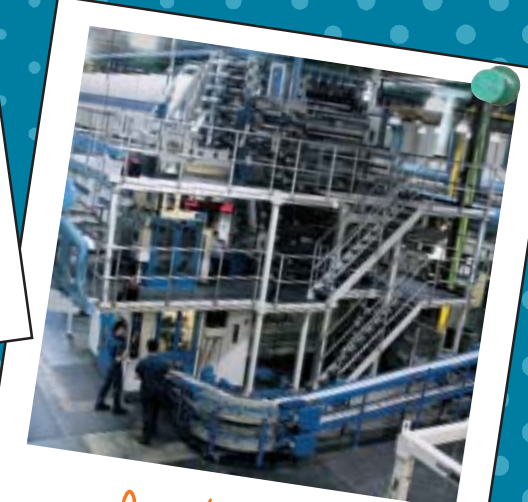
A LARGE CORPORATION USING TRAINING AND ITS EAP TO PROMOTE MENTAL HEALTH.