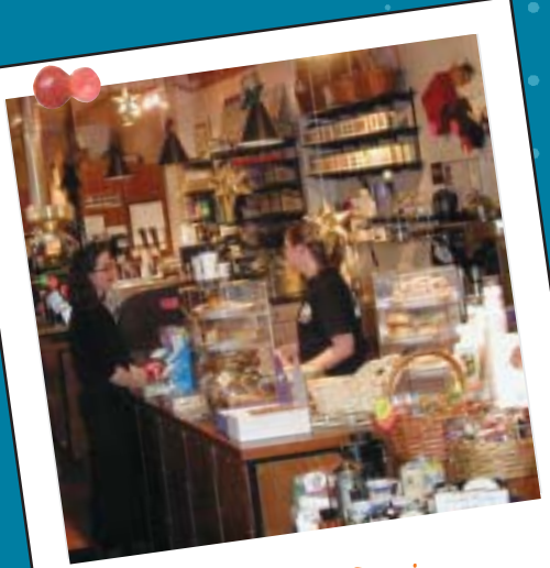
Coffee By Design LL BUSINESS THAT PROVIDES MENTA