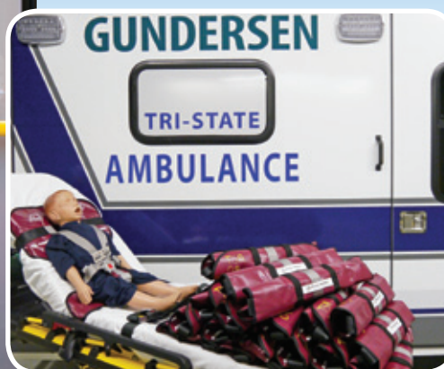
The Pedi-Mate system helps Tri-State's first responders transport children safely.